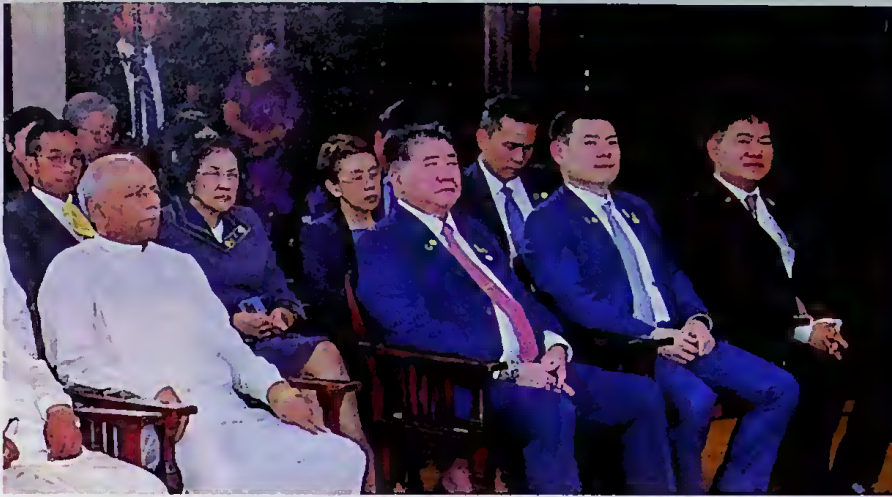
Prime Minister Dinesh Gunawardena and delegates from Thailand.

This is a milestone in our economic partnership, and operationalizing the FTA will be a priority. The FTA is expected to boost trade and investment ties between the two countries.