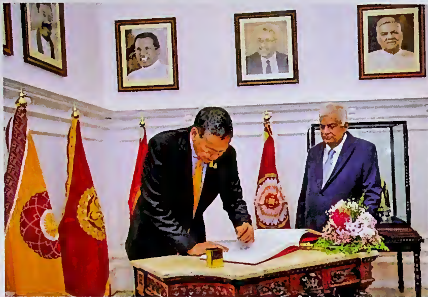
Prime Minister of Thailand Srettha Thavisin signing the Sri Lanka-Thailand Free Trade Agreement in the presence of President Ranil Wickremesinghe.

As Sri Lanka begins to stabilize its economy and regain international confidence towards recovery and growth, we are looking at Thailand's support as Sri Lanka undertakes this significant journey of economic transformation and integration with Asia.