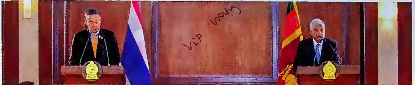
President Ranil Wickremesinghe and Prime Minister of Thailand Srettha Thavisin Forge Historic Ties, Sign Landmark Trade Agreement