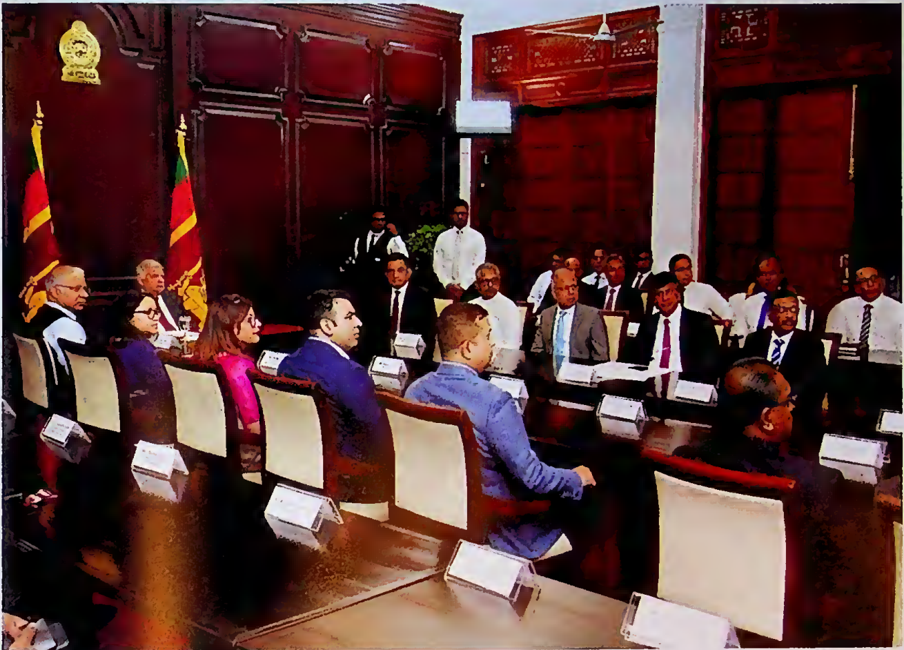
President Ranil Wickremesinghe and other delegates during the virtual launch of UPI.

Prime Minister Narendra Modi was confident that connection with UPI would benefit Sri Lanka and Mauritius. Digital transformation will be boosted, local economies will witness positive change, and tourism will be promoted. "I am confident that Indian tourists will prioritize destinations with UPI."