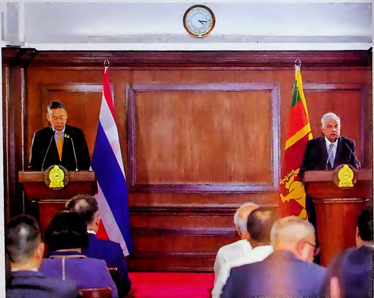
President Ranil Wickremesinghe (right) and Prime Minister of Thailand Srettha Thavisin.

I am incredibly pleased to welcome Prime Minister Thavisin and the accompanying high-level delegation to Sri Lanka, including the Deputy Prime Minister, Minister of Commerce, and the Deputy Minister of Foreign Affairs.