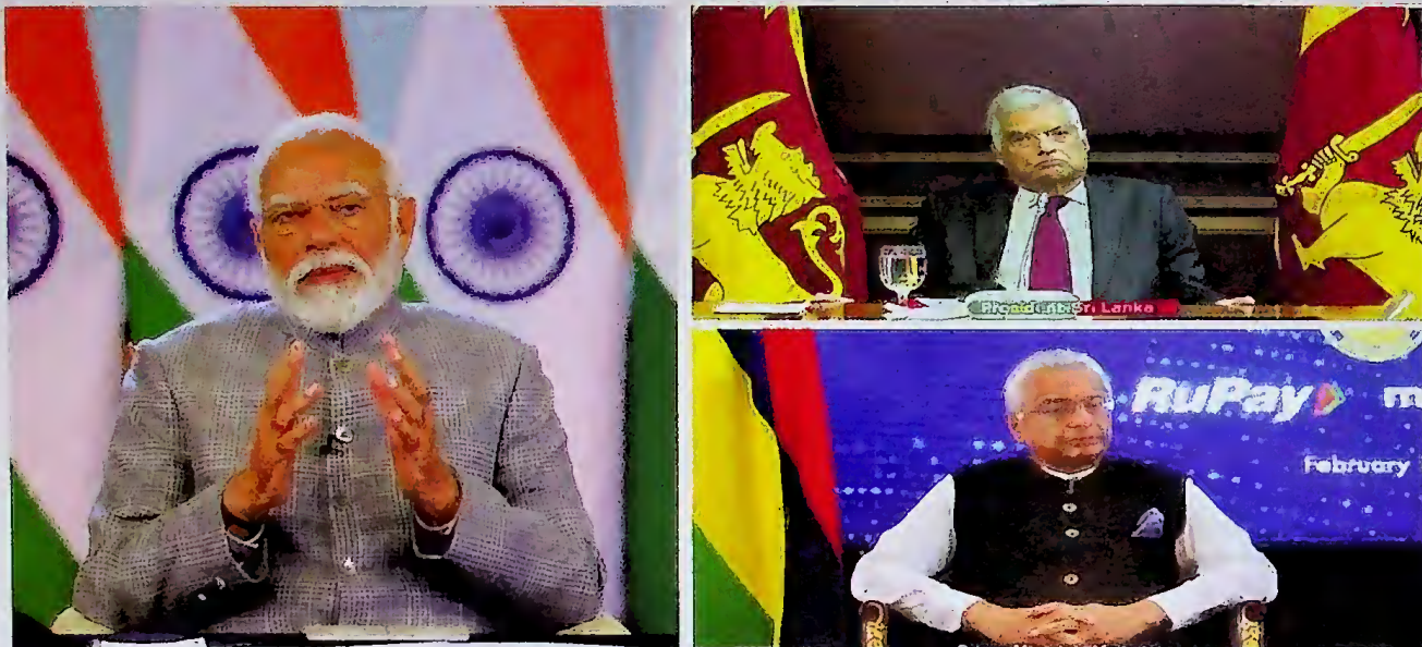
Prime Minister Narendra Modi, President Ranil Wickremesinghe and Prime Minister of Mauritius Pravind Jugnauth during the launch of UPI.

P rime Minister of India, Narendra Modi, President of Sri Lanka, Ranil Wickremesinghe and the Prime Minister of Mauritius, Pravind Jugnauth jointly inaugurated the launch of Unified Payment Interface (UPI) services in Sri Lanka and Mauritius, and also RuPay card services in Mauritius via video conferencing. President Wickremesinghe congratulated Prime Minister Modi for consecrating the Shri Ram Mandir at the Ayodhya Dham. He also emphasized the centuries-old economic relations. The President hoped to maintain the momentum of connectivity and deepening of the relationship between the two countries.