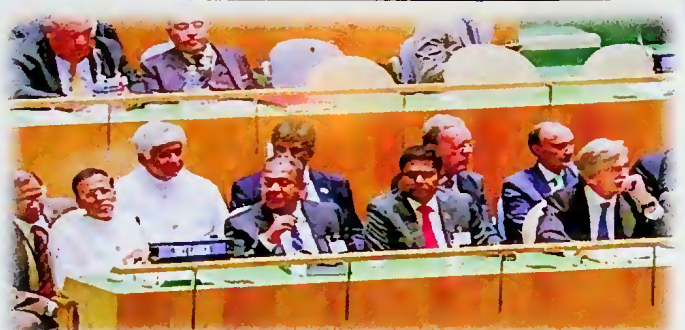
The delegation of Sri Lanka attend the opening of the 71st Session of the General Assembly