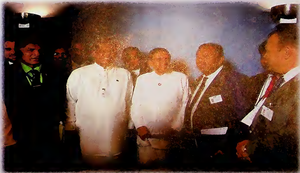
President Sirisena receiving felicitations after his address at the 71st Session of the General Assembly

Thank you, May the Triple Gem bless you.