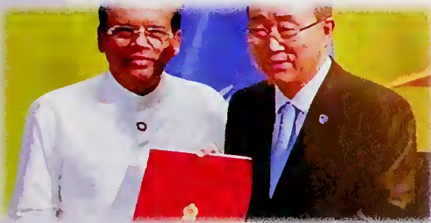
President hands over the Instrument of Ratification of the Paris Agreement on Climate Change to Secretary-General Mr. Ban Ki-Moon