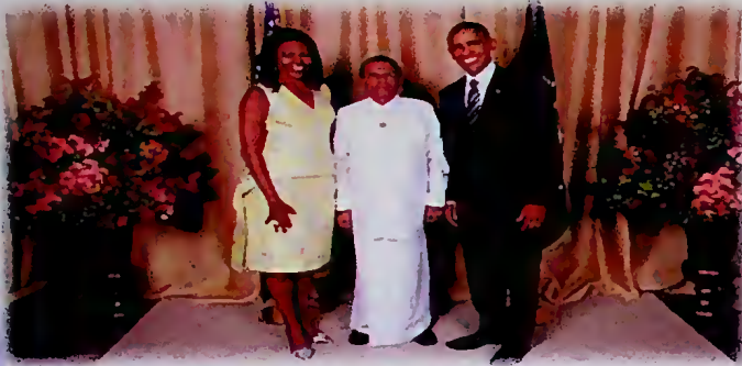
President Sirisena attends the reception hosted by President & Mrs. Obama on the occasion of the 71st Session of the General Assembly