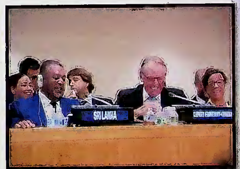
Foreign Minister Hon. Mangala Samaraweera with Deputy Secretary-General Jan Eliasson

Sri Lanka co-hosted a Pledging Conference to Re-finance the Secretary General's Peacebuilding Fund (PBF) held on 21 September 2016 at the UN Headquarters in New York on the sidelines of the 71st Session of the United Nations General Assembly. Sri Lanka, together with Kenya, Mexico, The Netherlands, Somalia, Sweden, Republic of Korea and the United Kingdom co-hosted the event. The conference was able to generate pledges from thirty countries amounting to a sum of US Dollars 152 million to support UN peacebuilding efforts across the globe. Foreign Minister Hon. Mangala Samaraweera, chaired one segment of the conference and delivered closing remarks on behalf of the co hosts. In his national statement delivered at the conference Hon. Mangala Samaraweera noted that Sri Lanka has been working closely with the Peacebuilding Support Office (PBSO) since the Presidential Elections of January 2015, when the Government prioritized reconciliation and development as twin agendas to be pursued in guiding the nation towards durable peace. In his closing remarks on behalf of the co hosts, Minister Samaraweera said that due to the cooperation of member states, the Fund will be able to continue to support critical projects in countries emerging from years of violent conflict and in other countries where peace is fragile and needs to be sustained.