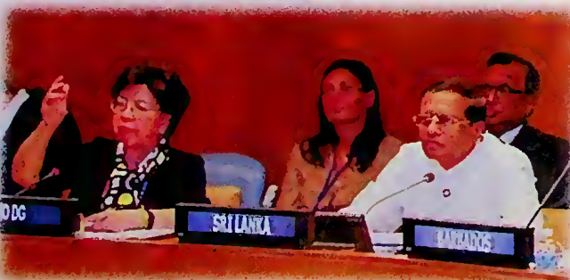
President Sirisena attended the High Level Meeting on Non-Communicable Diseases hosted by the UN Inter-Agency Task Force on the Prevention and Control of NCDs WHO and the Russian Federation