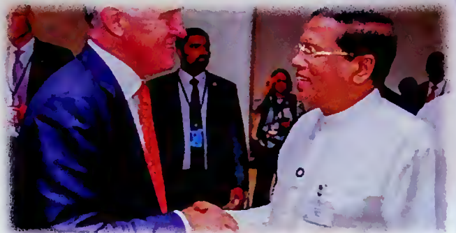
President Maithripala Sirisena held bilateral discussions with Australian Prime Minister Malcolm Turnbull