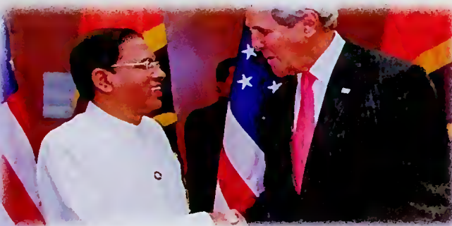
US Secretary of State John Kerry reassures full support to Sri Lanka during his meeting with President Sirisena on the sidelines of the 71st UNGA