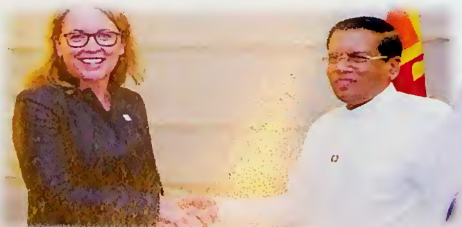
Chief Executive Officer of the Millennium Challenge Corporation (MCC) met with President Sirisena to discuss the Threshold Programme through which MCC provides assistance for selected projects