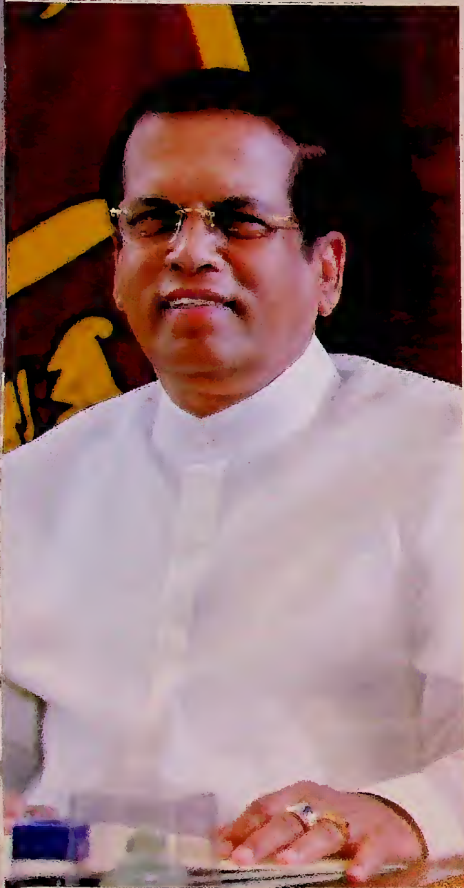
H.E. Maithripala Sirisena President of Sri Lanka February 04, 2019

Sri Lanka, which had been under the British rule for 133 years, gained independence on the 4th of February 1948. Each year, this day is celebrated with glory. Our prime objective should be to collectively commit ourselves to achieve the true meaning of the freedom we obtained with a new vision and renewed vigour.