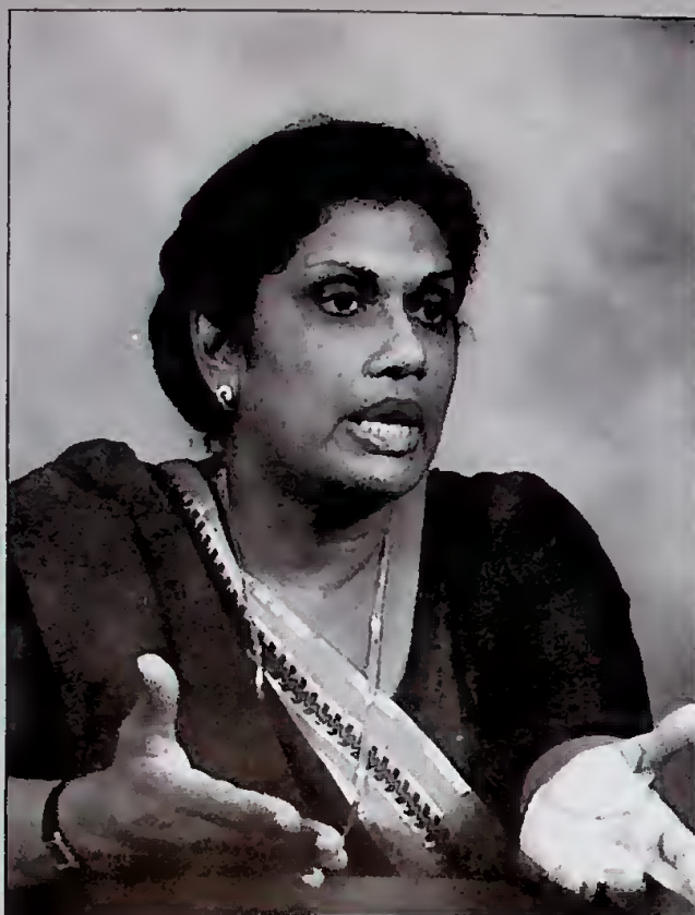
“These are the phantoms of the past who are still haunting us”